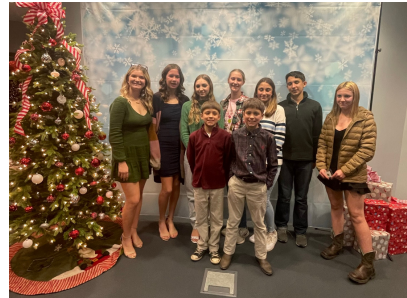
Thank you for your community service!