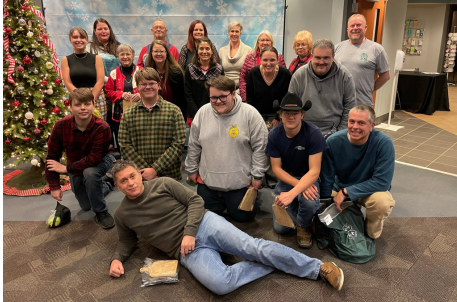
A big THANK YOU to our 4-H Volunteers!