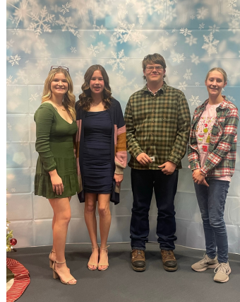
State & District 4-H Leaders