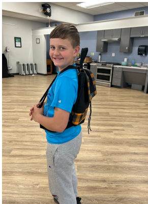
Last day of sewing for Unit 2 & 3!