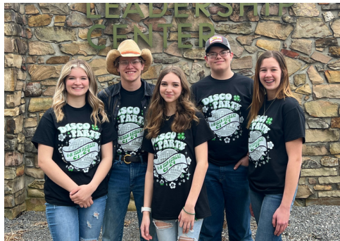
Area C1-C4 Delegates at 4-H Teen Retreat at Lake Cumberland 4-H