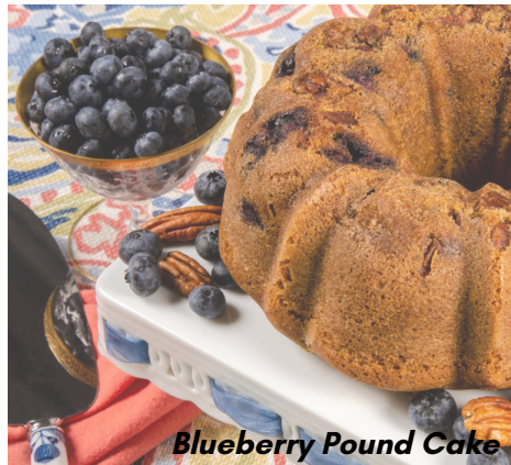
Blueberry Pound Cake