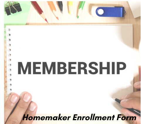
Homemaker Enrollment Form